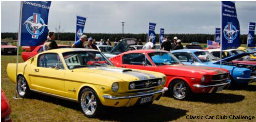
Classic Car Club Challenge