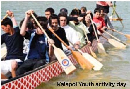
Kaipoi Youth activity day