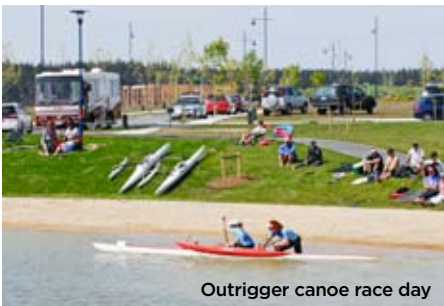
Outrigger canoe race day