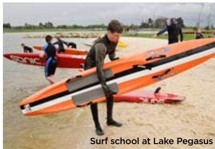
Surf school at Lake Pegasus