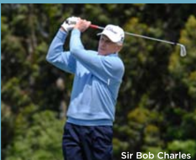
Sir Bob Charles

The tournament, held over two days (4-5 March) will also feature special guest appearances from Sir Michael Hill and Sir Richard Hadlee. Spectator entry is free, and tee off times start from 10am on both days of play.