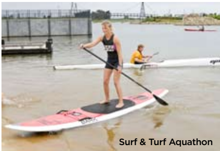
Surf & Turf Aquathon