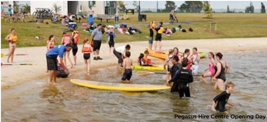
Pegasus Hire Centre Opening Day