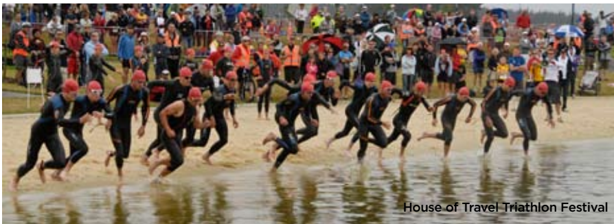
House of Travel Triathlon Festival